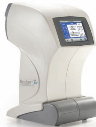
Reichert 7CR Auto Tonometer + Corneal Response Technology